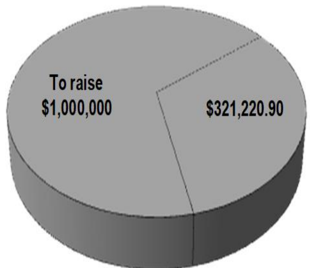
ProjectACTSpandas at 28 Jul 2019

Floral Ministry's Crate-of-Blessings for Project ACTSpand concludes today , and we have brought back our floral corner offering a variety of flowers to delight your senses. Those with pre-ordered crates, please also remember to collect them today. Thank you for your generosity over the past weeks!