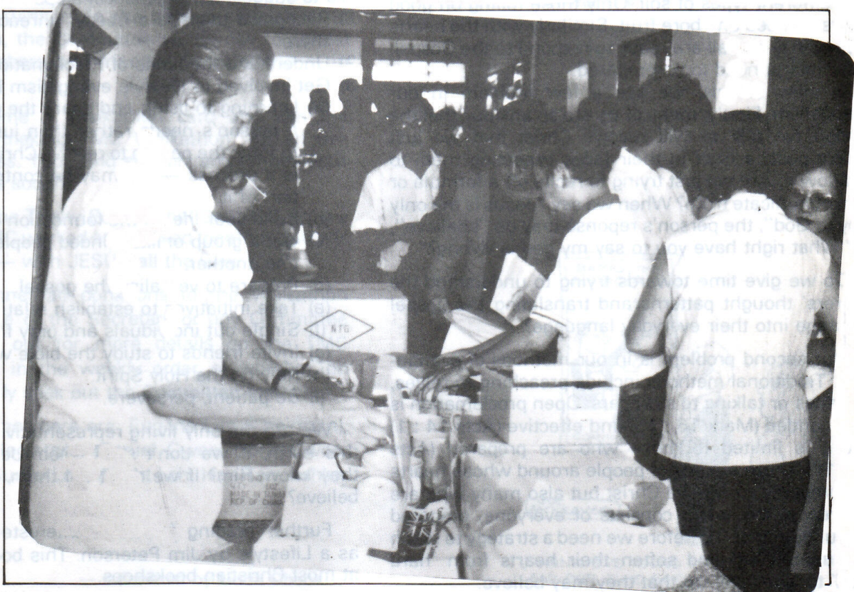
"Mugging" in progress