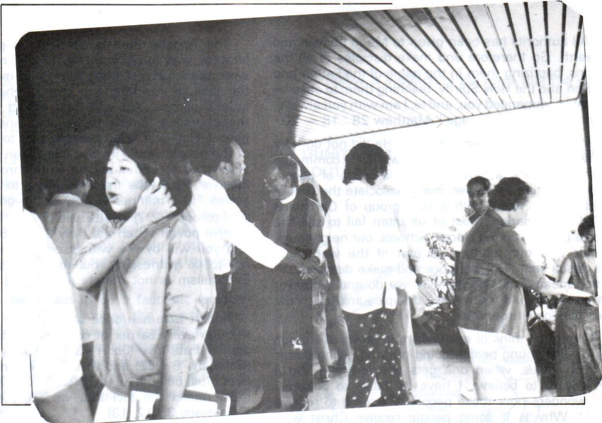
Wow! That sermon really made an impact on the ear, didn't it?