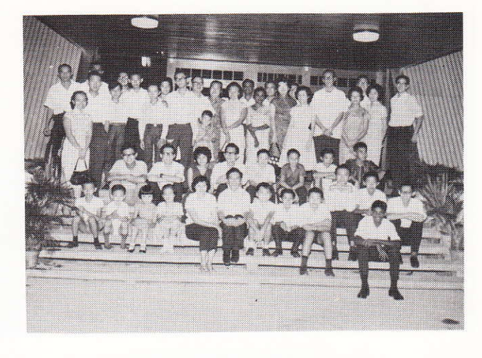
Can You Remember The Occasion?