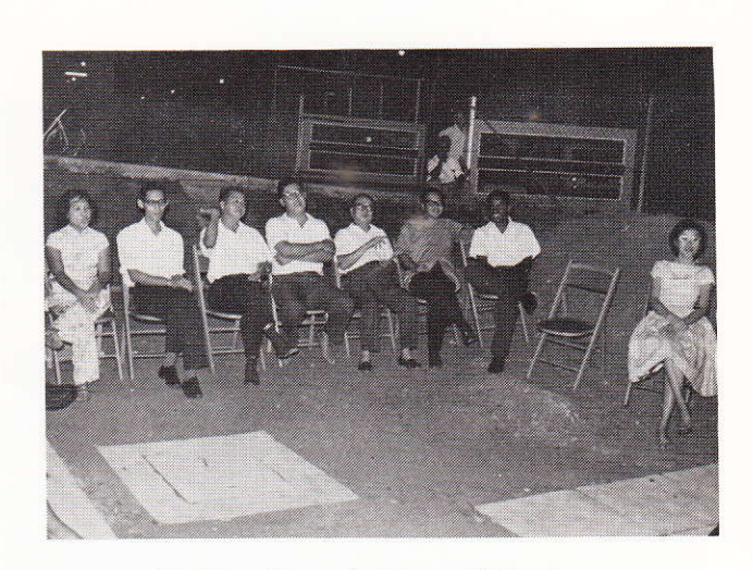
Can You Recognise Yourself Here?