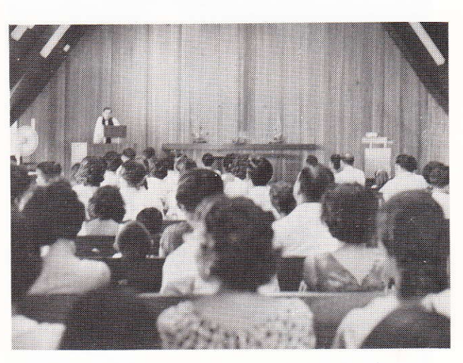
Ecumenical Sunday with the pastor of St Peter's Church Preaching