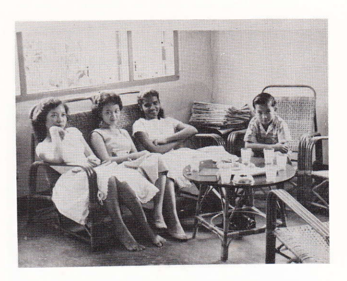
Do you recognise any of these 'early' MYFers?