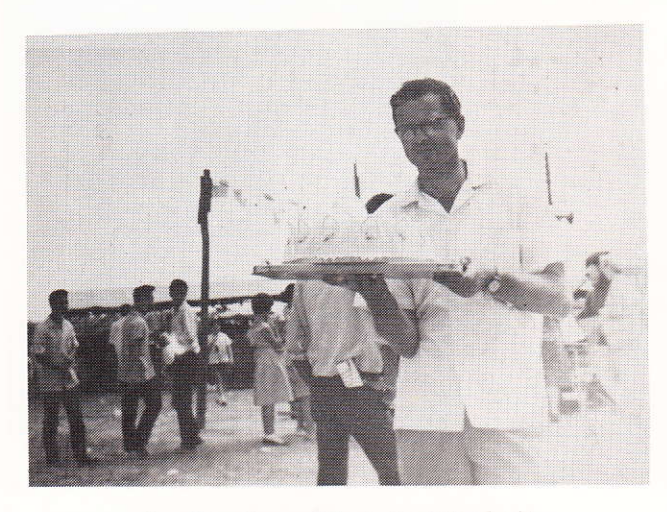
Can You Guess Who is the 'Vendor'?