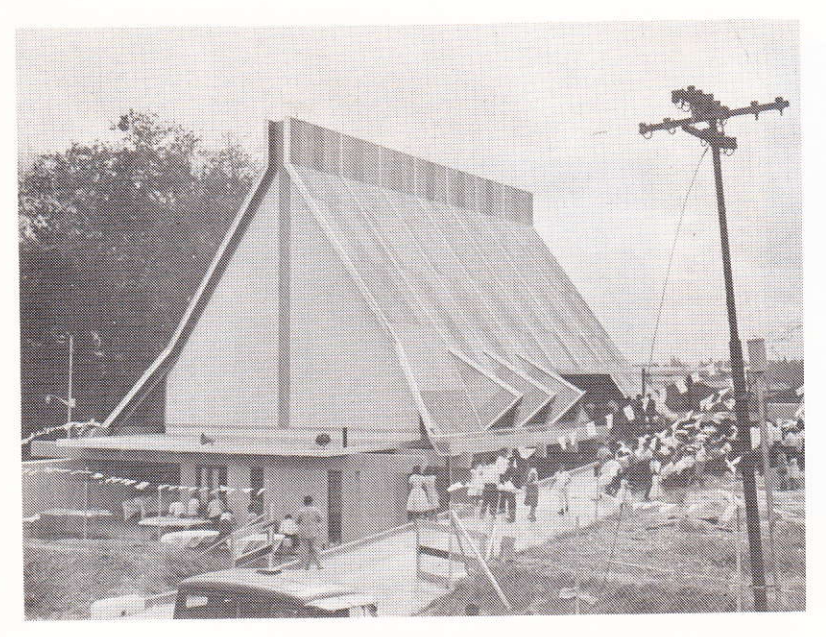
Official Opening of the Church