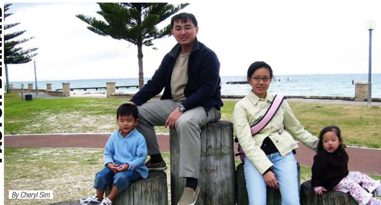
By Cheryl Sim